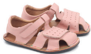
Color: Pink (smooth) Code: MKS9002PK Sizing: EU 21 - 30