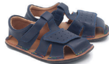
Color: Navy Code: MKS9002NV Sizing: EU 21 - 30