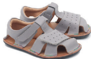
Color: Grey (smooth) Code: MKS9002GR Sizing: EU 21 - 30